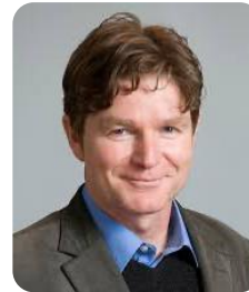
John F. Kelly